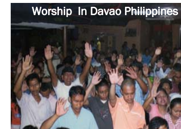
Worship In Davao Philippines