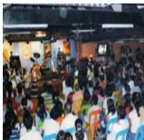
Above, a church service in the Philippines