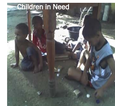
Children in Need