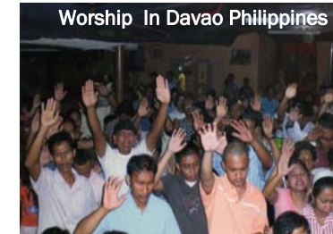
Worship In Davao Philippines