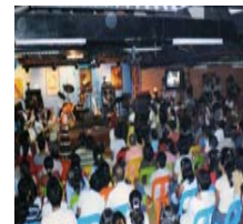
Above, a church service in the Philippines